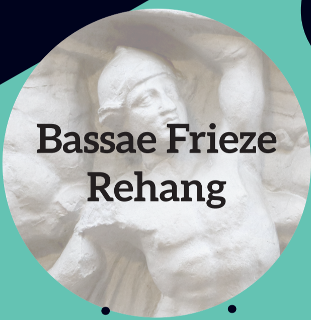
Bassae Frieze Rehang 18 Panels 63 New Brackets