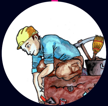
Illustrating The Ancient World