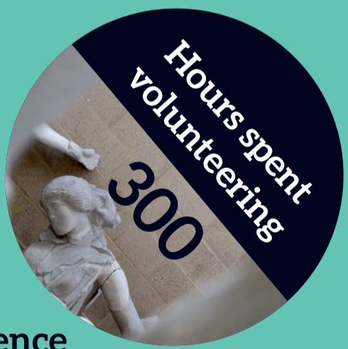
300 Hours spent volunteering 24 Volunteers