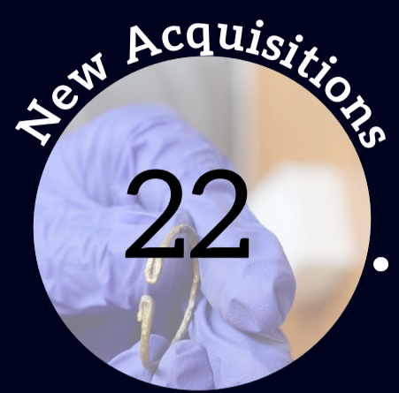
New Acquisitions 22 Derbyshire Schools Learning Service