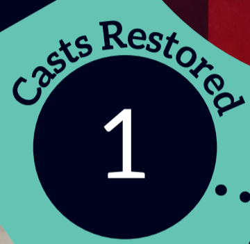
Casts Restored 1