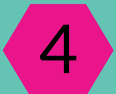
4 Remote Work Experience placements