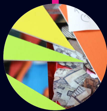
A Twist of The Hand