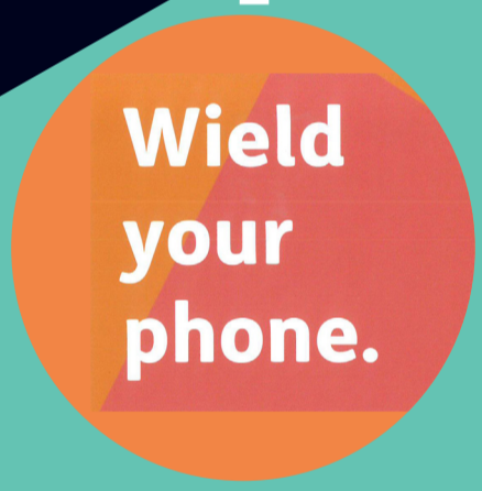
Wield your phone. 6 QR Codes