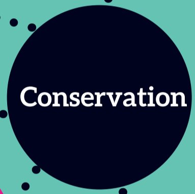
Conservation 1 Student Conservator 1 UCM Conservator