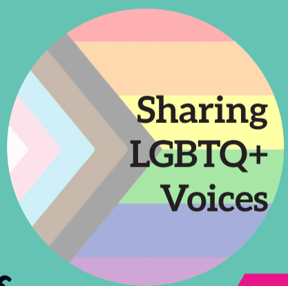
Sharing LGBTQ+ Voices