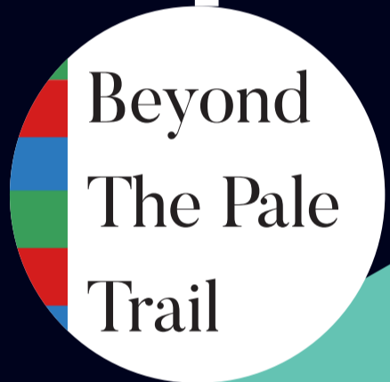
Beyond The Pale Trail