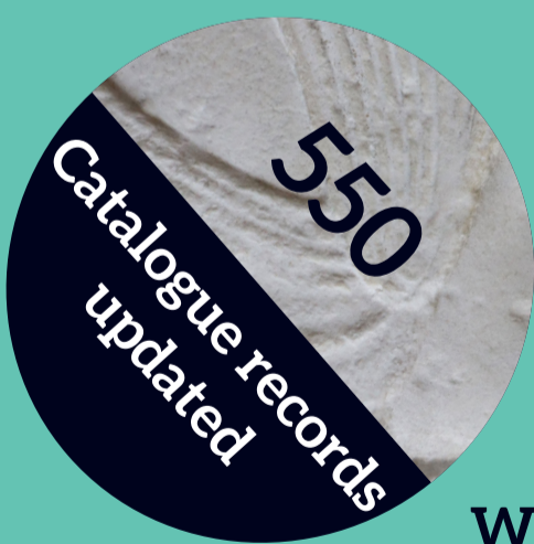
550 Catalogue records updated