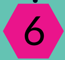
6 Student Volunteers