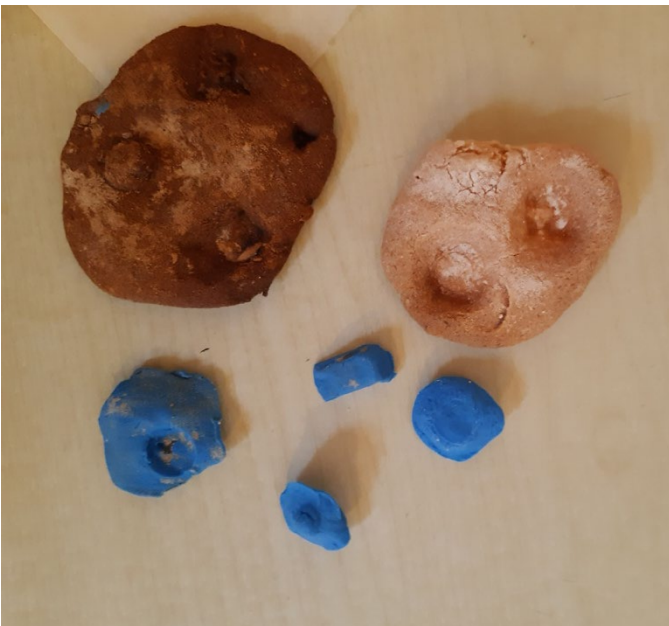
Some of our worst attempts at casting.