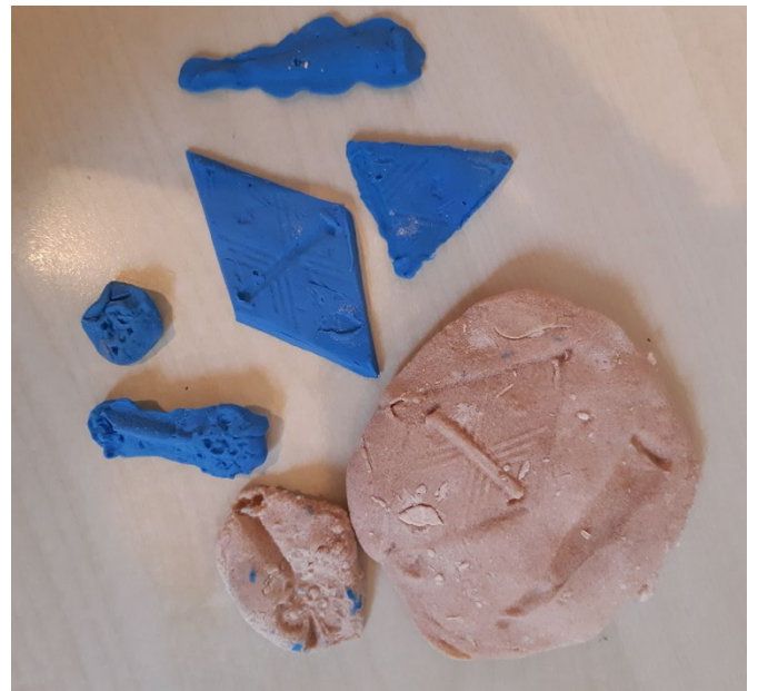
Some of our best attempts at casting.