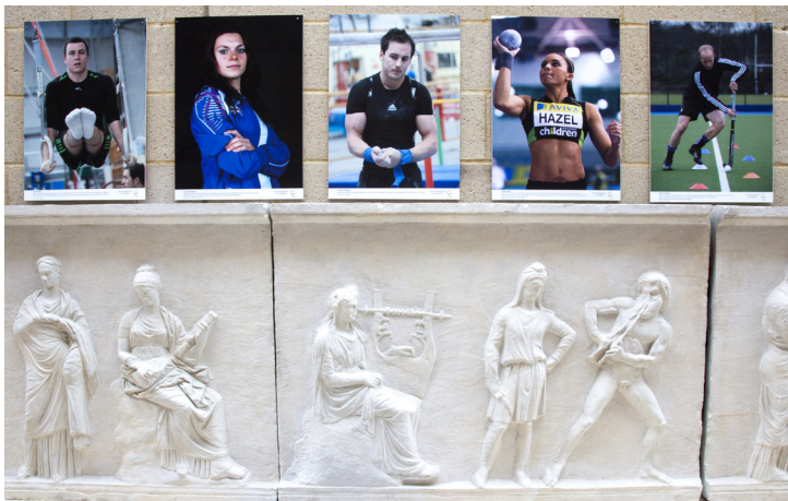
Cambridgeshire athletes are shown above panels from a monument to Leto in the Museum of Classical Archaeology.

We welcome our new colleagues and hope that alumni will soon get the opportunity to meet some of them, and to renew old acquaintances.