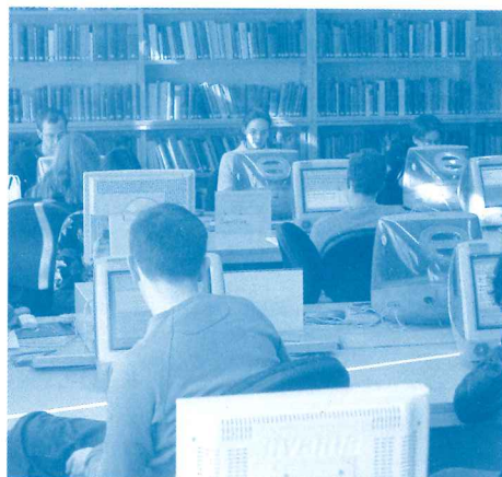
Students pore over computers in the Reserved Volumes Room.