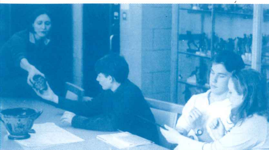
Sixth-formers handle Greek pots – with care.